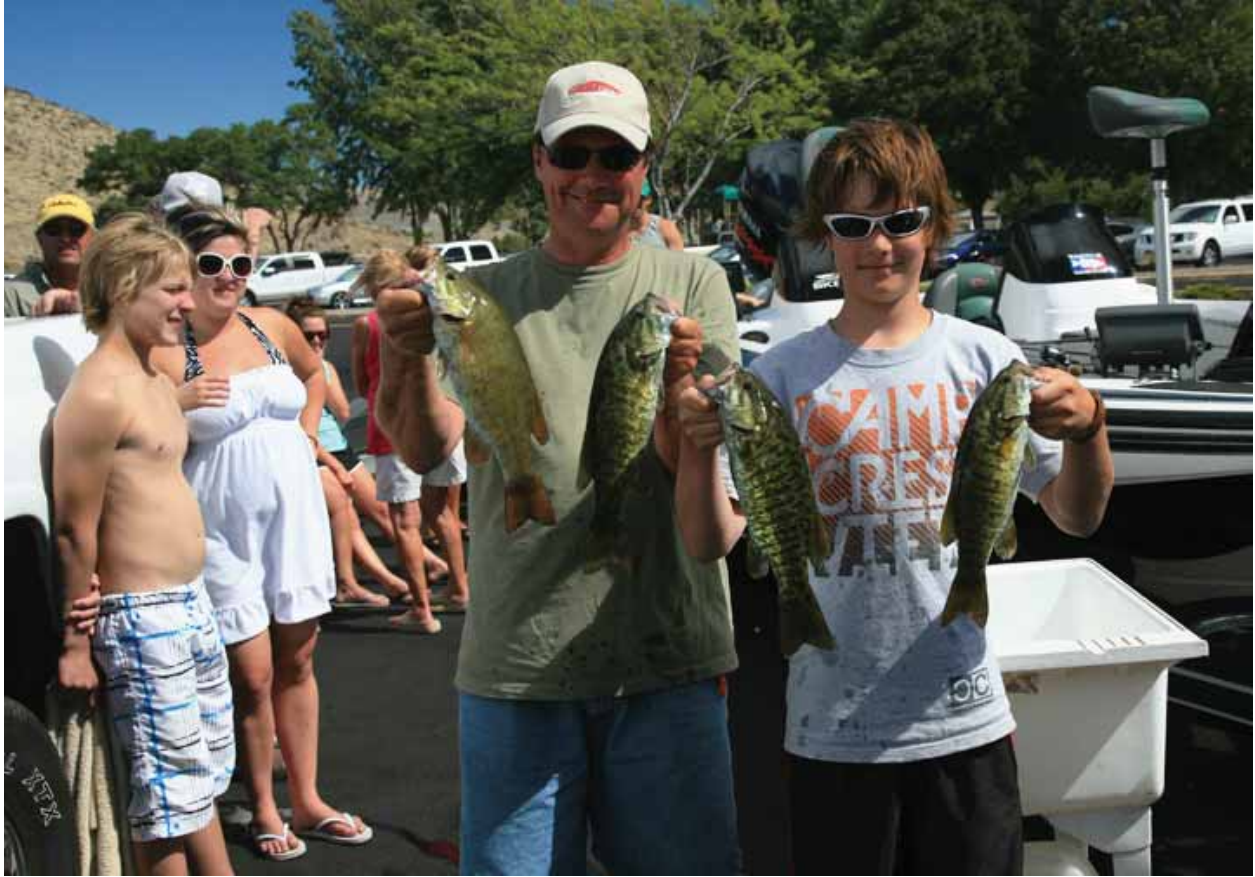
Crowd Pleasing Fish at La Page Park