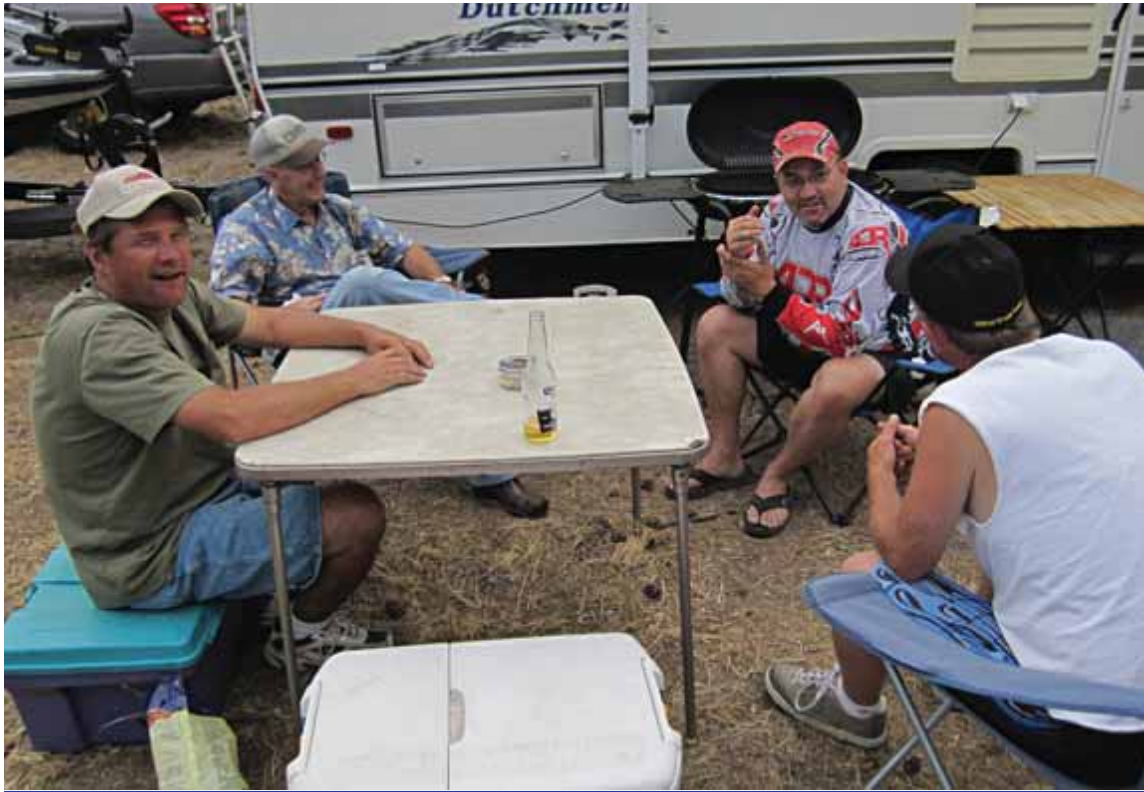
The Story Telling Saturday Evening